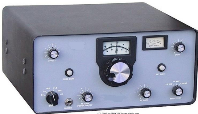
(Answer on page 6)