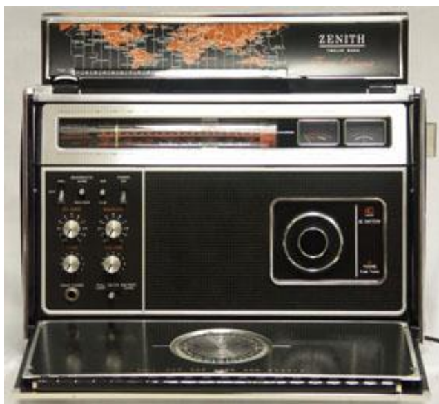
The last of the Transoceanics, the R-7000-2 (1981)

In early 1942, the Zenith Corporation unveiled the first in a long line of portable (if you can call a 20 lb, 22W X 12H X 8D radio portable!) shortwave/broadcast radios known as the Transoceanics. The first model was short-lived because of the shift in the US manufacturing community to war-related materials. After the war, production resumed. Immensely popular, they were all AC and battery-operated, and covered BC and most of the shortwave spectrum. While not really ham-related, they were popular with ham-wannabees, as well as the stereotypical armchair radio adventurer. A Transoceanic graced many a living room in the 50s and 60s. They were top quality, extremely well made, and produced in large quantities. The model shown on page 6, a B600 from the early 60s, was the last tube-type portable radio manufactured in the US. Succeeding transoceanics got smaller with the advent of solid state technology, and the line lived on into the early 1980s. Zenith's biggest competitor was Hallicrafters, with their Transworld series of radios, but Zenith was the king. They are all highly collectible, handsome, and desirable radios.