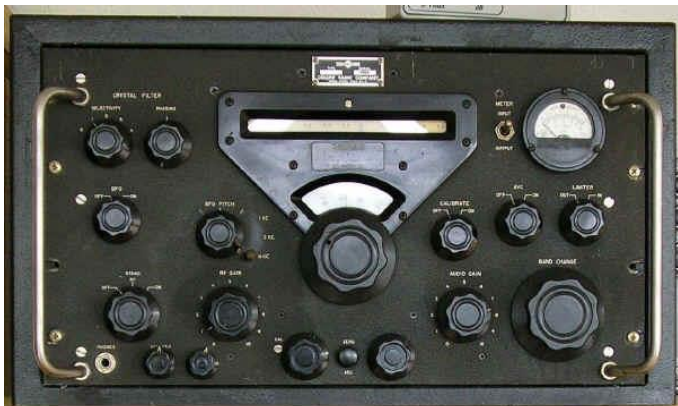
(Answer on pg 6)