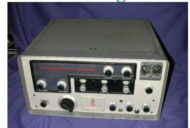
Name This Rig: